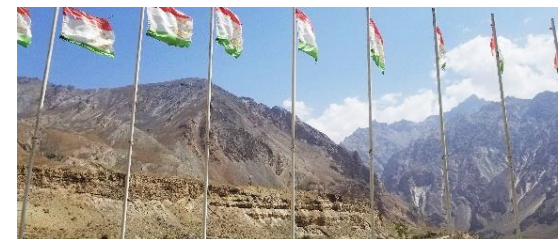
Your guide will take care of passports at checkpoints.

Day 3. Khalai Kum - Jizev (Bartang Valley): We will have an early breakfast so that we have enough time for our morning drive and our 2.5-hour afternoon trek up to Jizev Valley (7km, 2500m above sea level). The drive is about 180km. After 87km we come close to Vanj Valley and a passport checkpoint. In the Vanj district is the famous Fedchenko Glacier, the longest glacier in the world outside of the polar regions. On the way we will stop at a local Chai Hana to have lunch and see many beautiful villages on both sides of the Panj River.