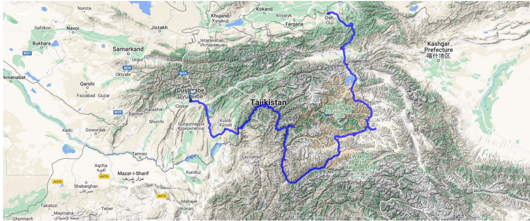
Our tour route goes through the Pamir Mountains mostly in the Gorno-Badakhshan Province of Tajikistan.

This itinerary includes a good opportunity to see a wide range of natural, cultural, and historical sites in Pamir. We would be happy to guide you on this itinerary or to customize it for you. Many of our tours are customized based on the interests, fitness levels, time availability, and budgets of our guests. We want you to have the best visit possible to Pamir so please tell us about your preferences so we can plan the best visit for you .