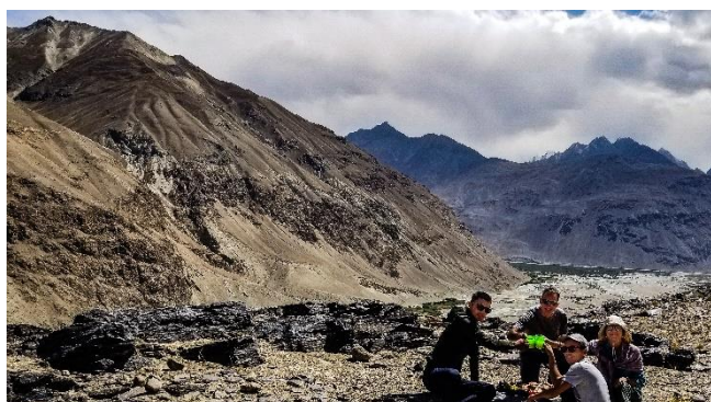
Spectacular views all along the road.

Day 6. Yamg – Alichur: The day's drive is 180km. In the afternoon we leave the famous Wakhan valley, through another passport checkpoint. A further 35km northward through Khargush pass (4344m) we join to the Pamir highway (M41). We will stop at a pleasant place for a picnic. We will take a short side trip to visit Bulun Kol and Jashil Kol lakes. We will then take a rough road to Alichur village stopping along the way at a small geyser. Dinner and breakfast in the home stay.