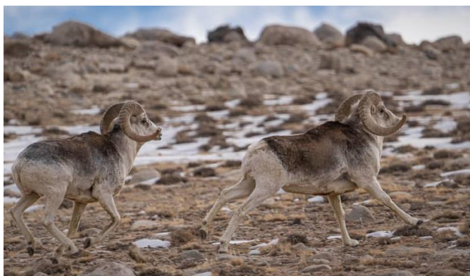
We see Marco Polo Sheep often.

Day 7. Alichur Muzdairyk valley: In the morning after breakfast, we will drive 30 minutes to Muzdairyk valley where we will meet our yaks and the men who manage the yaks. We travel on yak about three hours. On the way, we may see Marco Polo sheep and Ibex. We will picnic along the way at a scenic spot. In the afternoon we continue our journey, either on yak or on foot, depending on your preference. We will take out time to see Marco Polo sheep, trying to get close if you wish. In the evening we will return to Alichur. Dinner and breakfast in same home stay.