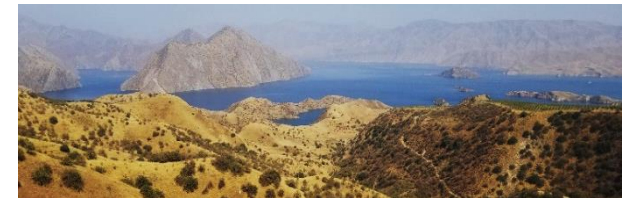
The reservoir behind Nurek dam is over 70km long.

Day 2. Dushanbe – Kalai Kum: After breakfast in the hotel, we will drive about seven hours, seeing many interesting sites along the 370km route. At 55km, we see the Nurek Dam, one of the 30 biggest hydropower facilities in the world, and second tallest man-made dam in the world, producing more than 3000 megawatts.