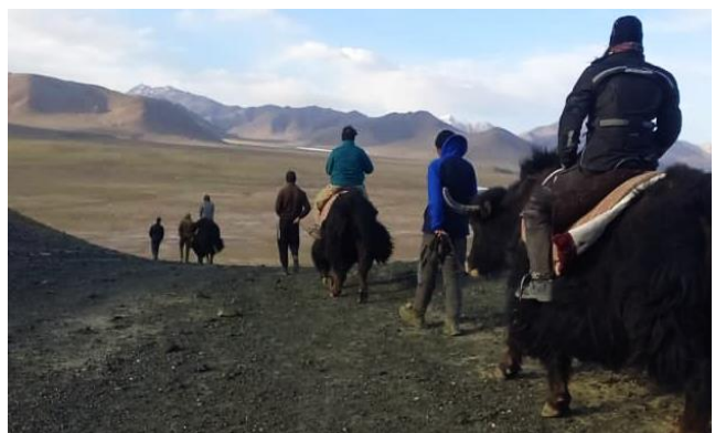
Yaks live easily on higher elevations in Tajikistan