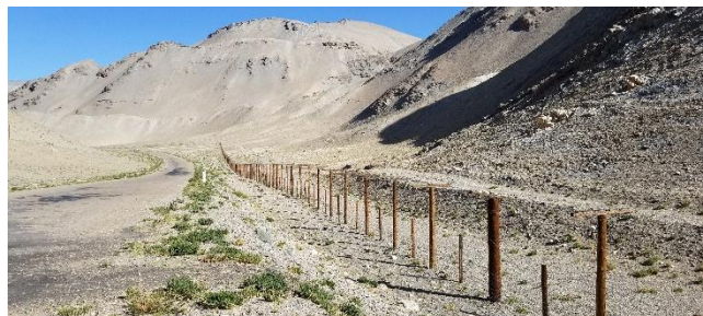
After crossing Akbaital Pass the Chinese border fence is nearby.

Day 8. Alichur – Karakul: We will drive 240km on the Pamir Highway (M41). We will stop in Murgab to have lunch and to walk a bit through the small bazaar in the town before continuing our journey towards Karakul village. On the way, we will stop on top of Akbaital pass (4655m),