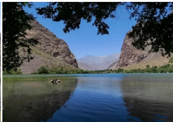
A second lake is a short distance away.