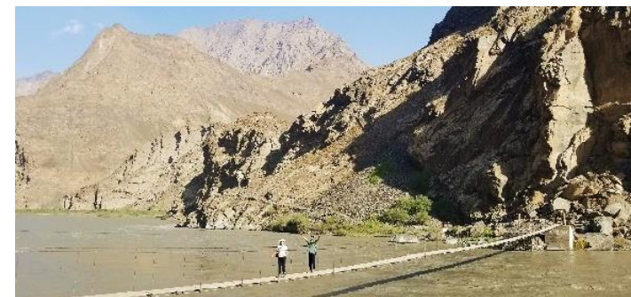
We will cross the Bartang River on a suspension footbridge.

In the afternoon we will arrive in Vamar, the administrative center of Rushan district, where we will leave the highway and drive another 25km into the Bartang Valley. We will cross a footbridge from where we start our trek up to Jizev Valley. Jizev is a narrow beautiful, green valley with a bright blue colored lake. There are only five households living in the valley and there is no road or electricity. We will have the opportunity to sample the simple Pamiri lifestyle here by staying in one of the homes for a night. Dinner and breakfast in the home stay.