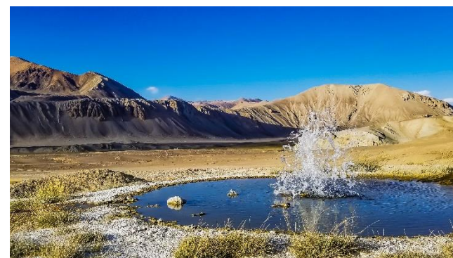
The geyser is small but hot (71°C, 160°F).

Day 6. Yamg – Alichur: The day's drive is 180km. In the afternoon we leave the famous Wakhan valley, through another passport checkpoint. A further 35km northward through Khargush pass (4344m) we join to the Pamir highway (M41). We will stop at a pleasant place for a picnic. We will take a short side trip to visit Bulun Kol and Jashil Kol lakes. We will then take a rough road to Alichur village stopping along the way at a small geyser. Dinner and breakfast in the home stay.