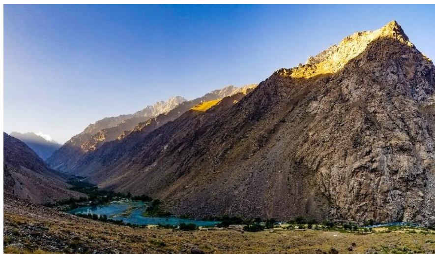
The families live at the base of the mountain.

Day 4. Jizev - Khorog: In the morning after breakfast, we have the option to walk 2km to the second lake before returning to our vehicle for a shorter day of driving, 95km. Once we are done visiting the valley, we will return to the footbridge and we continue our journey towards Khorog. Allowing for photo stops we will drive for about 2 hours. For lunch we go to a local restaurant or Chai Hana. In the afternoon we can discover the bazaar, the highest botanical garden in Central Asia (2320m), and the newly opened, and modern Ismaili Jamaat center. Dinner out. Breakfast in hotel.