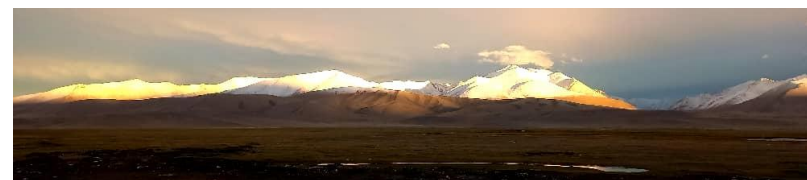
Lenin is visible from far away

Day 9. Karakul – Sary mogol – Tulpar kul lake (Kyrgyzstan): We plan a shorter drive of only 140km to allow for plenty of time to admire famous Lenin Peak (also called Avicenna Peak and one of the most climbed 7000m peaks) and to cross the international border (which often takes 45 minutes). After the border, we will reach the famous Alay valley with snow-covered mountains above 6000m. We can have lunch in Sary Tash village or Sary Mogol village depending on timing. In the afternoon we drive another 25km to get even closer to Lenin Peak. The yurt camp by the beautiful Tulpar Kul Lake has amazing views of Lenin Peak. We relax walking by the lake or up a small hill to admire the beauty of the Peak. Dinner and breakfast in a yurt stay.