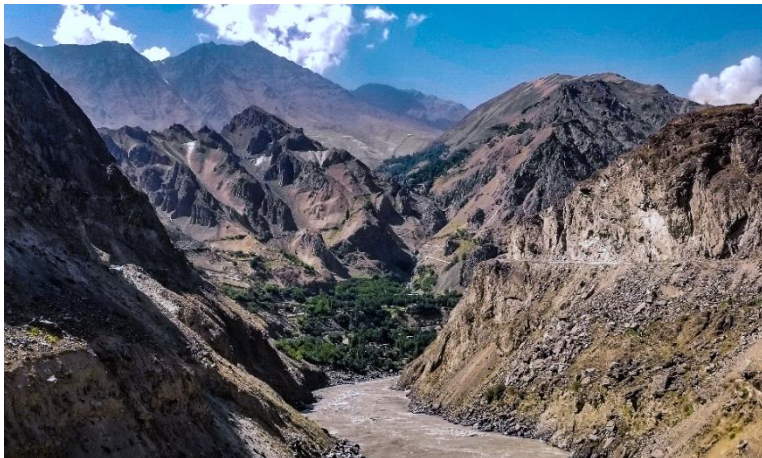
The Panj River forms the border with Afghanistan (left).

Later in the Vose district, we will stop to see the Khoja Mumin Salt Mountain named after a local hero who rose against the Emir of Bukhara in the 19 th century. It has been estimated that it contains 50-60 million tons of salt. We will also pass the ancient city of Hulbuk which was built from the ninth to 11 th centuries under the Samanid dynasty. During Soviet time, many archaeologists excavated the site, and found many items now on display in the Museum of National Antiquities in Dushanbe. 20km beyond Vose is the large town of Kulob. In Kulob, there is the mausoleum of Khoja Mir Sayid Hamadomi, a poet and scholar of the 14 th century. He was born in Hamadan, Iran and is famous for spreading the word of Islam in Kashmir. He died in Afghanistan and is buried here. We will also see many Afghan villages on other side of the river. Dinner and breakfast in the home stay.