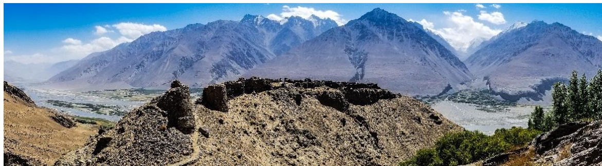
Ancient Yamchun Fortress overlooks the Wakhan Valley.

Day 5. Korong - Yam: Today we will cover 220km. On the way, there are many hot springs and historical sites, and we will visit several of the best ones. Of note are the Yamchun hot spring, Yamchun fort, Yamg Pamiri house, Museum of Muboraki Vakhoni, and several interesting shrines. We can choose (in advance) to stay in a traditional Pamiri house or in a guesthouse. Dinner and breakfast will be where we spend the night.