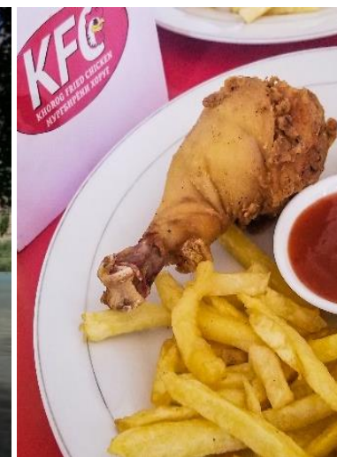
Missing city food? Try Khorog Fried Chicken.